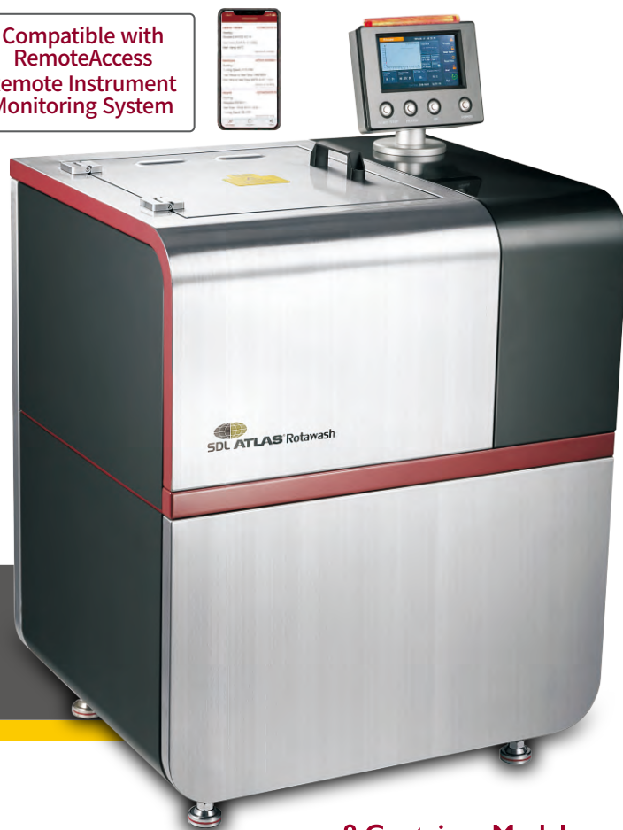
8 Container Model

Compatible with RemoteAccess Remote Instrument Monitoring System