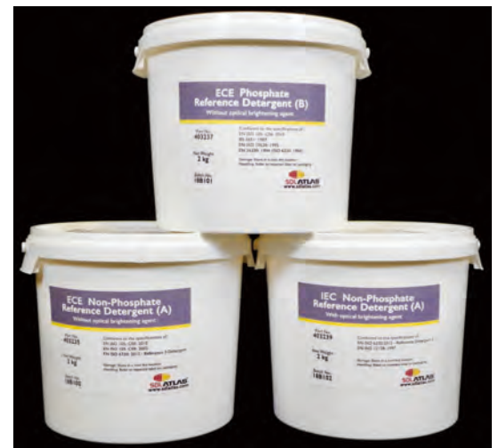
ECE and IEC Detergents