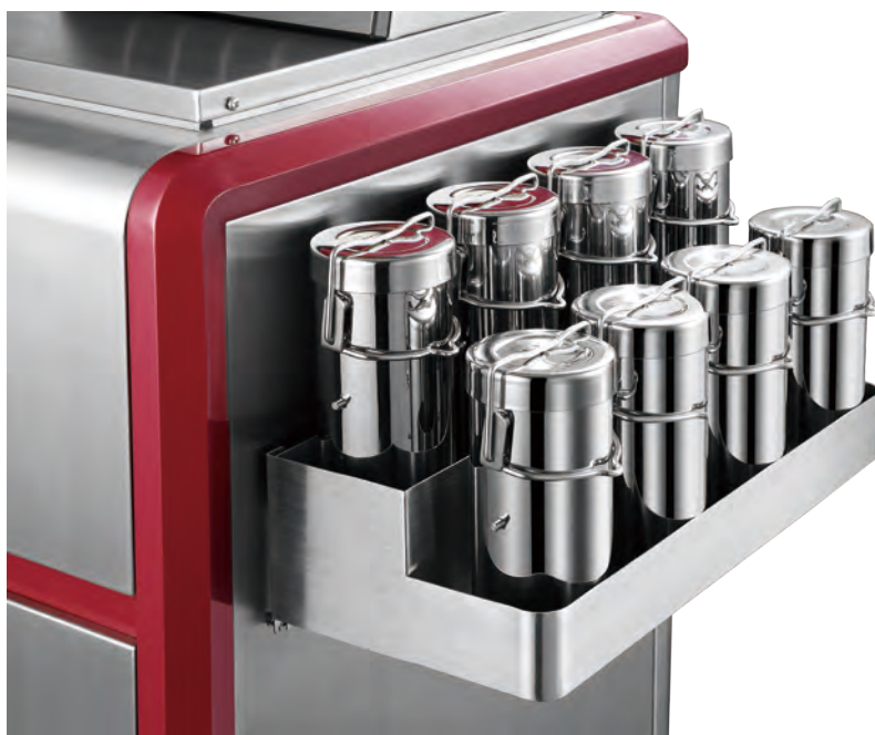
Side Mounted Container Holder

Red flash lighting and beep to alert the end of the test.