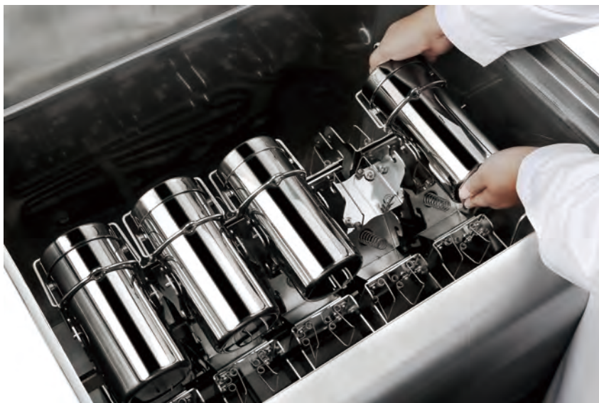
Press-in-place loading for sample containers

Red flash lighting and beep to alert the end of the test