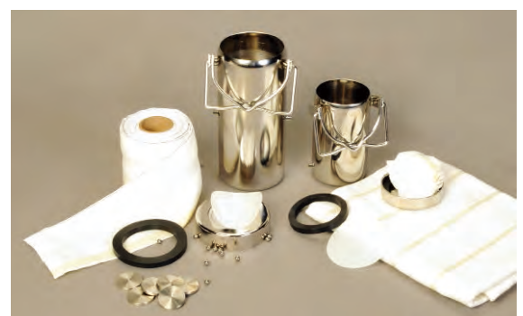
Colorfastness to Washing Accessories and Multifiber