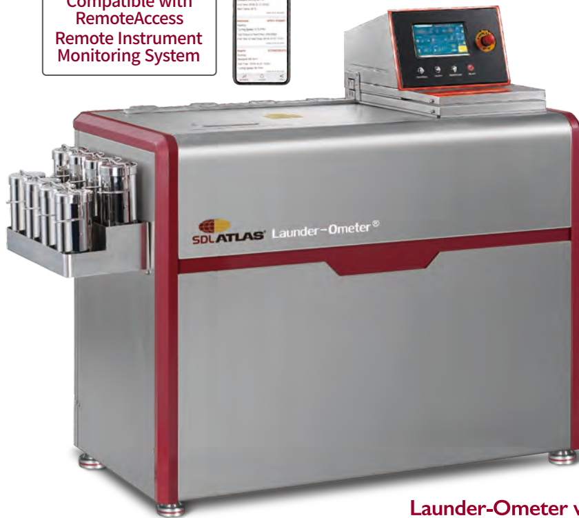
Lauder-Ometer with Detachable Container Holder

SDL Atlas offers two options for users in evaluating colorfastness to washing, the Launder-Ometer and the Rotawash. Both instruments are designed to conduct colorfastness to washing and dry cleaning in compliance with all major international and retailer standards for low temperature tests.